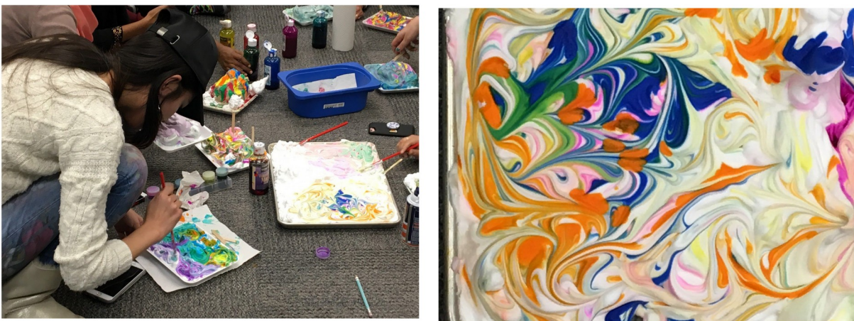
Figure 2 & 3 Shaving Cream Activity

Ashley's children's literature students also came to acknowledge the complexity a wordless book offers. Students concluded these books were "more complicated than we give them credit," acknowledging prior notions of easily reading a book of pictures. By challenging such narrow notions of reading and children's literature, these future teachers were (re)considering educational literacy practices, goals, and measurements. That these books are written and marketed for young readers also challenges narrow views of young readers' capabilities. These future teachers came to value the impact of such texts and their challenges. It is our hope challenging and changing notions of reading and cultivating an openness for the kinds of books we advocate will translate into how literacy practices operate in future classroom spaces.