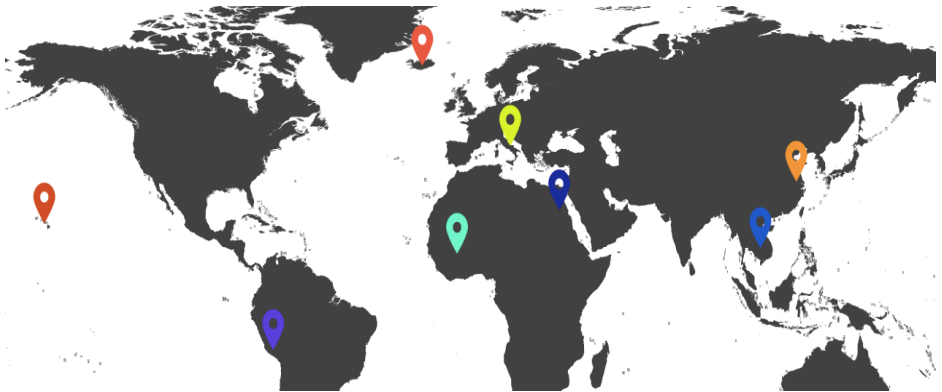
Figure 1. Screen-grab of map showing regions included in first batch of data published to http://dacura.scss.tcd.ie/seshat/ .

This short report describes the publication of the first batch of historical data produced by Seshat: Global History Databank . The data is available as free, open access material here ; see also our website for more information on the Seshat project as a whole.