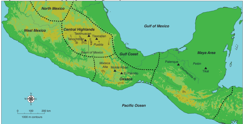
Figure 1. Map of Mesoamerica showing sites and places mentioned in the text.

including Oaxaca (Blanton et al. 1993; Spores 1967, 1984), the Basin of Mexico (e.g., Carrasco 1971), and the Maya area (e.g., Blanton et al. 1993; Demarest 2013; Masson 2012), archaeologists have noted marked shifts in the nature of governance between the Classic and Postclassic periods, although not always in the ways that Wolf (1959) proposed (Figure 1).