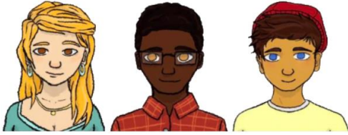
Figure 1: Images used for each character. From left to right: Liz ( she/her ), Will ( he/him ), and Alex ( they/them ).

critical stories, for a total of 38 stories. For examples of each, see Table 1. These were the same stories as those used in Arnold et al. (2021) with one additional practice story created for the present study. The newly written practice story and its questions are available at https://osf.io/vrw7t/ . The remaining trials from Arnold et al. (2021) can be found at https://arnoldlab.web.unc.edu/publications/supporting-materials/arnold-mayo-dong-2021/ .