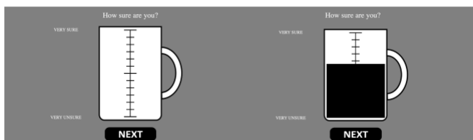
Figure 1: The novel confidence measure as seen by participants, at empty (0%, left) and partially filled (approximately 70%, right).

presented after the initial decision was made, such that children needed to reflect upon the decision they had just made when estimating their confidence instead of merely reporting the likelihood of their choice based on the visual display. Reaction time for the probability task was also recorded as an implicit measure of confidence. Reaction time is typically inversely correlated with explicit confidence ratings (Ackerman & Koriat, 2011; Roderer & Roebbers, 2014), and so collecting these data enabled validation of the novel scale while also providing insight into implicit confidence processes like information processing and action execution (Ratcliff & McKoon, 2008).