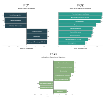
Figure 1: Contribution of dimensions weighting more than |.2| on PC1, PC2, and PC3, along with their values.

We then explored the dimensions that contribute the most to each component. Specifically, we extracted dimensions whose weight (W) was higher than |.2| —usually interpreted as a small effect size (Cohen, 1988). This resulted in six dimensions for PC1, nine dimensions for PC2, and in eight dimensions for PC3 (see Figure 1).