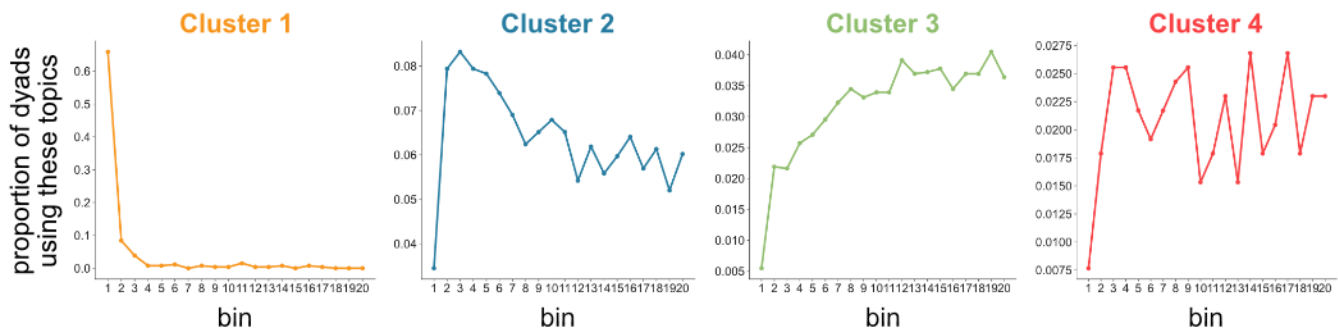
Figure 3: Topics are clustered based on six different node metrics. (A) List of topics assigned to each cluster. Cluster 2 contains the candidate “launch pad” topics. (B) How topics in different clusters vary across the six different node metrics. (C) Average proportion of dyads discussing topics clustered by network features for each time bin. These subplots emphasize the temporal trends for each cluster of topics. Note that different subplots have different y-axes, indicating frequency differences between clusters.

in-degree, eigenvector centrality, and clustering coefficients. We think of these topics as “conversational launch pads”.