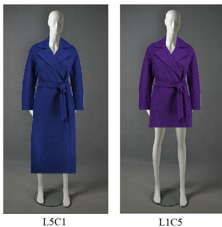
Figure 1: Extremes of length and color

Stimuli were taken from a not-yet published pre-registered study (Verheyen, Egré, Hampton, Scerrati, & Urbonavičiute 2022) and consisted of 25 images depicting coats varying in size (from long to short) and color (from blue to purple). This set of images was validated by Verheyen and colleagues for studying the conjunctions of long blue coat and long purple coat by measuring assent within the constituents. From a larger set of images, they selected stimuli for which either 0%, 25%, 50%, 75%, or 100% of participants rated the image as a member of each constituent. For example, in the case of the longest and most blue coat, 100% of participants rated the image as a long coat, and 100% of participants rated it as a blue coat. To illustrate the dimensions along which the stimuli varied, extremes of length and color are presented in Figure 1. Stimuli names refer to their relative position within the two dimensions, with L standing for length, and C standing for color. For example, L5 = longest, and C1 = most blue.