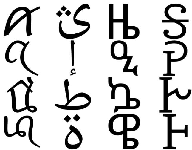
Figure 1: Glyph rendering samples (column-wise left-to-right: Tai-Viet, Arabic, Ethiopic, and Cherokee).

In total, 4,747 glyphs were produced with a Python script as PNG images from standard Unicode ranges (Figure 1). Glyphs were uniformly rendered in black and placed on transparent background, using Noto typefaces for each writing system.