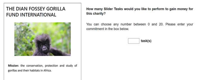
Figure 1: A Round of the Charity Commitment Task. On the left side of the screen participants saw the charity’s name, picture, and mission. On the right side of the screen, participants had to enter a number from 0 to 20 indicating how many “Slider Tasks” they were willing to perform to gain money for the presented charity.