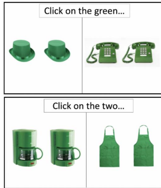
Figure 3: Sample Clothes vs Appliances displays from Experiment 2 from the Color (top) and Number (bottom) conditions.

In line with our predictions, participants selected the category with the stronger color association at comparable rates in the baseline condition (color typicality effect replicating the results of Rohde and Rubio-Fernandez, 2022) than in the two critical conditions (color association effect), with the difference not reaching significance (both p 's > .05; for the full model output, see Table 2). Also as expected, there was a significant effect of Description ( p =.0006), whereby the lexical category with the stronger color association was selected more often following color descriptions than number descriptions (Fig. 4).