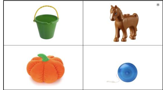
Figure 1: Sample displays from Experiment 1 for the lexical categories Fruits (top), Appliances (middle) and Toys (bottom).

All four objects were different in each display, rendering color redundant. As the only category with predictable colors, Fruits served as our baseline.