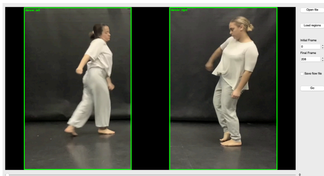
Figure 1: Stimuli presentation and ROIs selection on FlowAnalyzer.

To obtain a measure of the degree of coordination between dancers, a time series of the pixel change from frame to frame was obtained. FlowAnalyzer software (Barbosa & Vatikiotis-Bateson, 2016) was used to extract motion from 2D video sequences through Optical Flow Analysis (OFA). OFA is based on a computer vision algorithm called Optical Flow that computes pixel displacements between consecutive frames in the video. FlowAnalyzer allows the definition of rectangular regions of interest (ROIs) and disinterest (RODs). All velocity vectors within each region of interest are combined into a single measure. The ROIs of our stimuli are presented in Figure 1. Cross-correlation analyses were performed on the resulting data on Python with a time window of 500 msec and yielded the following average values (see Table 1; see Figure 3).