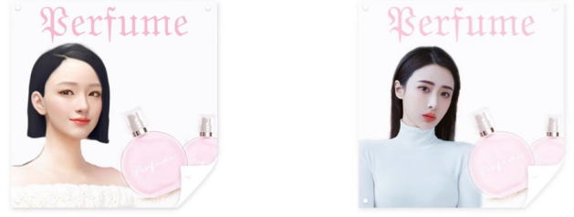
Figure 1: The advertising pictures (The left is the virtual influencer, the right is the human influencer).

same to provide participants a more realistic viewing experience. The advertising pictures are shown in Figure 1.