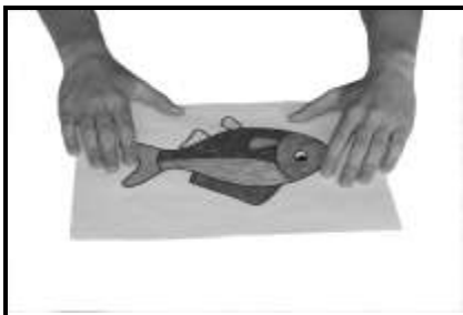
(a) external perspective

All pictures were taken from the same viewing distance (ca. 92 cm) and the same downward angle (ca. 30°). They were all subsequently turned to grayscale and pasted onto a white background.