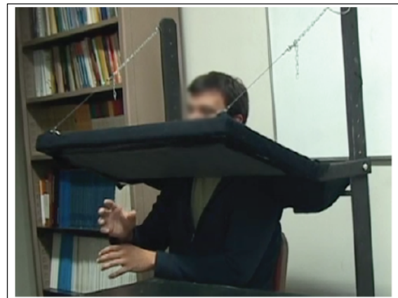
Figure 1. Participant under the visual blind.

Visual Blind. A large black piece of felt was attached to a wooden frame that was sized to fit comfortably around participants’ torsos. The frame could be lowered to rest just below shoulder height, thus obstructing participants’ view of their hands while still allowing full range of movement and thus full use of gesture space (see Figure 1).