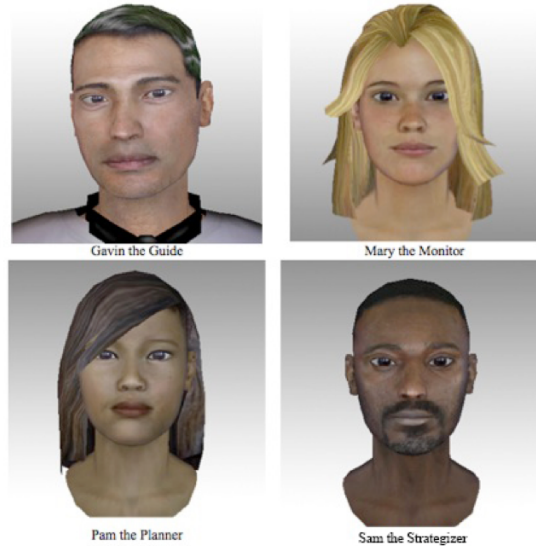
Figure 2: The four pedagogical agents in MetaTutor.

its relevancy for those subgoals, judge their learning (both for the page presented and overall), and assess how well they feel they know the information. As such, the number of metacognitive process prompts contributes more interaction between the students and Mary. Lastly, Sam the Strategizer supports the students in summarizing the content they read, to take notes on the content, coordinate the informational sources (text and diagram), and reread, if needed. The cognitive strategies prompted by Sam contribute to a notable amount of time interacting with the students.