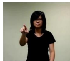
Figure 1. Snapshot of the gestural stimuli with the gesturer pointing forwards.

Two gesture video clips were paired with either related or unrelated temporal words. These gesture clips were constructed by recording silent videos of a female actor facing and looking at the camera and pointing either backwards or forwards along the sagittal axis. The video included the actor’s face. One video was made for each gesture of interest, with an emphasis on its stroke. (Figure 1 shows a snapshot of the gestural stimuli used.)