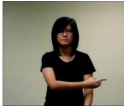
Figure 3. Snapshot of the gestural stimuli with the gesturer pointing to her left.

Materials. The same words in the previous experiment were used. Two gesture video clips were constructed by recording silent videos of the same female actor pointing either left or right the lateral axis. One video was made for each gesture of interest, with an emphasis on its stroke. Figure 3 shows a snapshot of the gestural stimuli used.