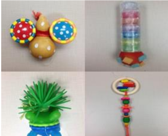
Figure 2: Photographs of 4 novel objects

Four novel objects (Figure 2) and four familiar objects were used as stimuli. The familiar objects were a shoe, a dog, a book and a cup. A set of familiar substitute objects (a banana, a cat, a duck, a hat, and a car) was also on hand in case a child did not know the name of one of the familiar objects.