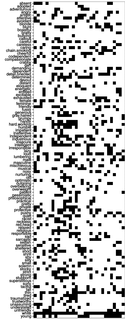
Figure 2: Feature matrix (adjective by family member) supplied by Informant One.