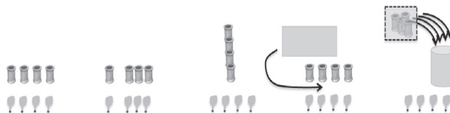
Figure 1: Schematic of each matching task. From left to right: one-to-one match (task 1), uneven match (task 2), orthogonal match (task 3), hidden match (task 4), “nuts-in-a-can” (task 5). Image is from Frank et al. (2012).

Matching tasks (Everett & Madora, 2012; Frank et al., 2012). Participants completed five non-verbal and non-symbolic exact quantity representation tasks in the following order: a one-to-one matching task, an uneven matching task, an orthogonal matching task, a hidden matching task, and a “nuts-in-a-can” task (see Figure 1). In every task, the experimenter presented a quantity of spools of thread (approximately 1” tall, 3/4” in diameter) and asked the participant to construct a row of un-inflated balloons (approximately 4” long and 2” wide) that matches the number of spools of thread. In the one-to-one task, the experimenter placed the spools one at a time in an evenly spaced line from left to right. In the uneven task, the spools were presented in the same manner as in the one-to-one task, but broken randomly into smaller groups of two and three. The orthogonal task is identical to the one-to-one task except that the row of spools is presented in a line perpendicular to the participant. The hidden matching task is identical to the one-to-one task except that the row of spools is hidden from the participant after being presented. In the “nuts-in-a-can” task, the experimenter places spools one by one into an opaque cup. Participants were tested once per task on each quantity from four to twelve in one of two random orders, totaling forty-five trials per participant.