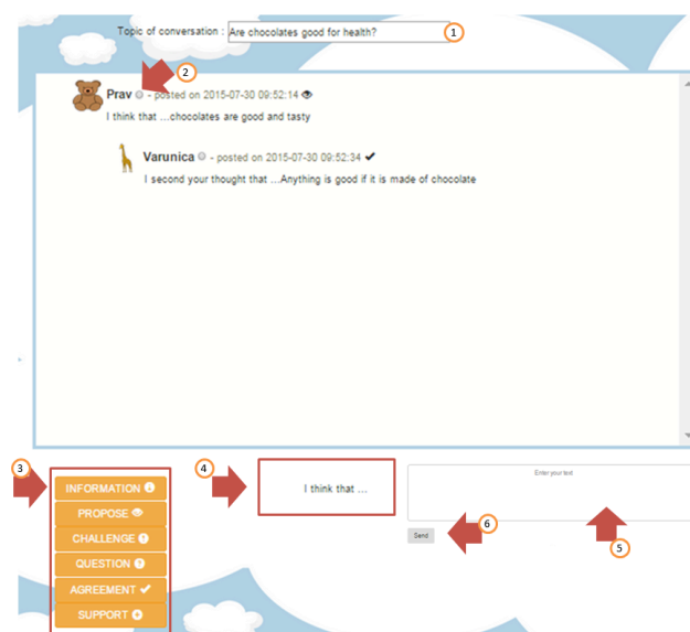
Figure 1: Dialog Game Screen.

The Freechat application was of similar design and appearance as the Scaffold application, and included the turn-by-turn use features, but did not feature the dialog act label buttons and sentence-opener display. Thus, users took turns simply entering messages, without the scaffold steps.