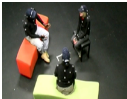
Figure 1: Participants engaged in triadic interaction

Participants were brought into the laboratory in threes and seated in a triangular formation so that they all had good visual access to each other (see Figure 1). The researcher read aloud a fictional moral dilemma, the 'balloon task' (see Task section, below), which has been used for studying dialogue, and is known to stimulate discussion (Howes, Purver, Healey, Mills, & Gregoromichelaki, 2011). The group was provided with an opportunity to ask questions before the researcher left the interaction space and the task began. Interactions ended when participants reached a joint decision. Groups that failed to reach agreement had their interaction terminated at approximately 450 seconds (7 minutes 30 seconds).