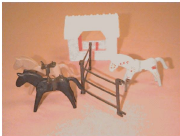
Figure 1: Sample not-all scenario from Musolino and Lidz (2006): 2 of 3 horses succeed at jumping over the fence.

Children’s ability to access the inverse scope interpretation has been shown to be sensitive to manipulations of experimental context. The methodology typically used to assess children’s scope disambiguation is the Truth Value Judgment Task (TVJT; Crain & McKee, 1985). In the basic TVJT, children are presented with a background story about the actors—for example, horses engaging in some activities. After this background story, children watch as the horses attempt to complete an action, such as jump over a fence. The critical not-all result state meant to prompt the inverse scope interpretation is illustrated in Figure 1, where the white horse fails to jump over the fence.