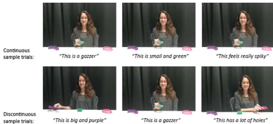
Figure 1. Schematic depicting sample trials in the learning phase for the Continuous and Discontinuous conditions in Experiment 1. Between each trial, the speaker rested both hands in her lap and smiled at the participant.

Stimuli and Design Three novel words— gazzer , cheem , and tobu —corresponded to one of three novel objects, each characterized by a different color, texture, and shape (see Figure 1). Half of participants were exposed to one set of word/object pairings, and half were exposed to a second, counterbalanced set of pairings.