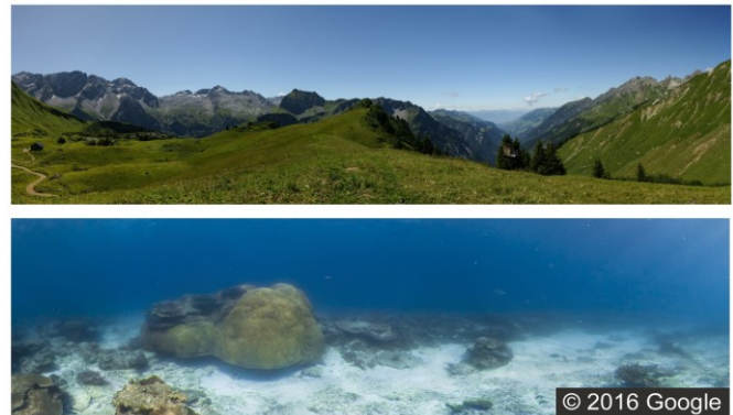
Figure 1: Above: Crop of panorama D (Dry) condition (adjusted from Wikimedia Commons). Below: Crop of panorama W (Wet) condition (Google Earth, 2016).

Virtual environments were displayed on four walls of a 5.2 x 5.2 WorldViz CAVE using Unity 3D version 5.3.5, providing a 360-degree view. Eight short-range 120 Hz projectors provided 5.12 x 2.75 meter projection of 2580 x 800 pixels per wall. Four cluster rendering workstations: Intel Xeon E5-1630 v3 3.70 GHz, 32 GB RAM, NVIDIA Quadro M6000, Windows 8.1 Pro 64-bit processed the synchronization of projections. Visual stimuli consisted of 2D panoramas of a mountainous landscape (D: Dry) and an underwater scene (W: Wet) (see Fig. 1). The resolution of both panoramas exceeded that of the total resolution of the four CAVE walls and were thus displayed at the highest possible level of visual quality.