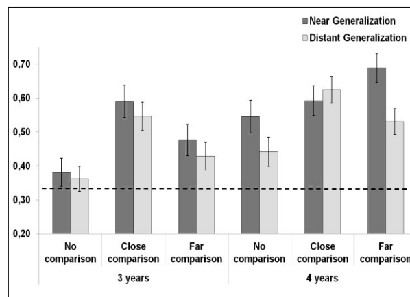
Figure 2. Proportions of relational choices as a function of the learning (no-comparison vs. close comparison vs. far comparison) and the generalization conditions (near generalization vs. distant generalization). The error bars correspond to one standard error and the dashed line represents chance level (33.33%) between the taxonomic, the thematic and the relational choices.

As for the comparison between close and far learning, they differed in the distant generalization case, F(1,148) = 4.03, p < .05 , but not in the near generalization case, F(1,148) = 2.94, p = .09 . In the older group, in the close learning case,