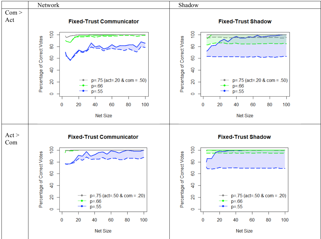
Figure 3: For the fixed-trust agent the top row shows the results for act = .2 , com = .5 (cf. Fig. 1), the bottom row shows act = .5 , com = .2 (cf. Fig 2). Dashed lines represent percentage correct for individual votes, solid lines for the majority vote.

accuracy of the collective vote as a function of group size, and in the levels of accuracy reached: where evidence quality was lowest ( p = .55 ), accuracy was almost 20 percentage points lower even for the largest group. This decreased collective performance holds even though individual accuracy rise with communication.