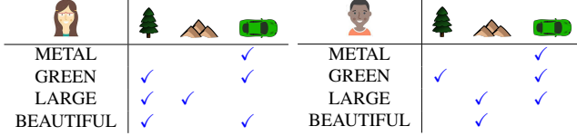
Figure 1: A typical world state: Speakers are likely to agree on more objective judgments, and less likely to agree on more subjective judgments.

over world states, the Pearson correlation between the truth values of A(s, x) and A(s', x) is equal to \kappa(A) , whenever s, s' are two different speakers. In the special setting where there are two persons s_1, s_2 , this reduces to two Bernoulli variables with fixed means and correlation, and we can write