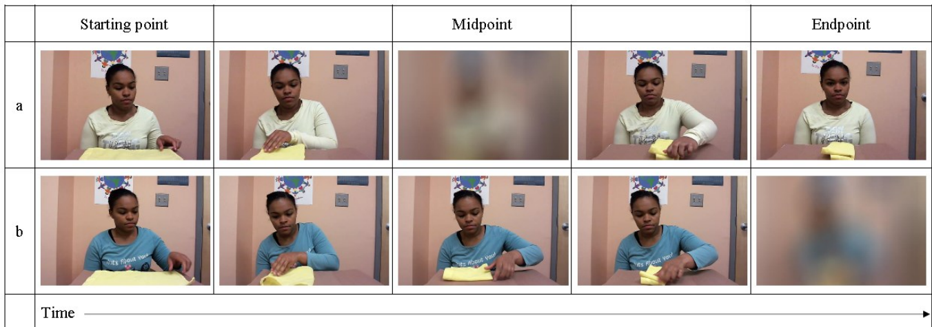
Figure 1. Examples of a training trial for a bounded event (folding up a handkerchief) that includes the two versions of the event: (a) mid-interruption (actor in yellow shirt), (b) end-interruption (actor in blue shirt).

except that the actor wore a blue shirt. All videos were then edited to introduce an interruption during which the screen turned blurry. Each video was edited twice, once to create a mid-interruption and once to create an end-interruption, depending on where the interruption was placed. In all cases, the interruption took up one-fifth of the total video duration.