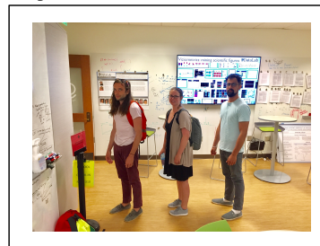
Figure 1: Marr's levels of analysis for waiting in line.

each standing behind another. This social behavior implements the computation of a first-in, first-out (FIFO) queue. A FIFO queue is a simple function used in computer science, for example to prioritize computer processes in the CPU. A FIFO queue takes as input a stream of entries, maintains the order of those entries, and outputs entries in that order. The representation that is used to solve the FIFO queue problem in the case of waiting in line is to maintain a linked list data structure between elements of the queue, and pop elements off the list as needed. A linked list is another data structure used computer science, in which each entry contains a "pointer" to the next element in the list. To "pop" a linked list means to remove the head element. In the example of waiting in line, the distributed algorithm that implements this linked list is for each person in the line to keep track of who is ahead of them. The physical implementation used to keep track of who is ahead of you in the line is simply to stand behind that person. Figure 1 illustrates this example.