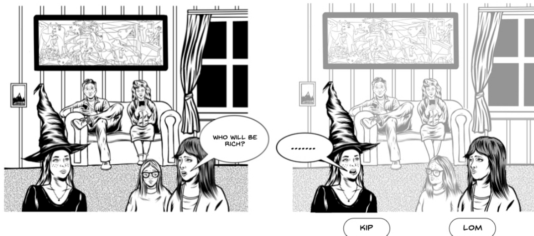
Figure 2: Trial example in the test phase for the inclusive minimal category.

The experiment had two phases. In the training phase, participants were taught the pronouns in the control and training sets (6 person categories). Each training trial had two parts: a scene where a question is asked, and a scene where the question is answered with a pronoun form in the language (cf. Figure 2). There were 12 training trials (2 repetitions per form). Participants were given feedback on their answers.