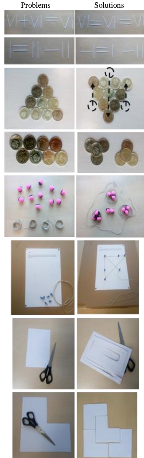
Fig. 1: The eight problems in initial configurations presented to the participants in the interactive format (left column) together with the sample correct solutions (right column). In the static format (not depicted) each problem elements were printed on a paper sheet, and a solution had to be drawn.

Problems administration. In all the 8 problems, there was an identical instruction for each variant, and the variants differed only in the presentation method and response format. In the static variant, problems were given on a sheet of paper, with a blank space for making notes and drawings, and for providing a solution using a pen. In the interactive variants, the participants were given a cardboard box with respective objects placed on it, but were not provided with anything to write with, so they had to physically manipulate the objects provided. Participants were tested in individual cabins. The time limit for each problem was 5 minutes.