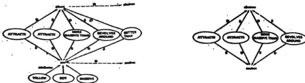
FIG1. Partial depiction of the analogy between solar system and hydrogen atom, showing a person's presumed initial knowledge of the solar system and the mapping of that knowledge to the atom.

By the structure-mapping account, two factors should enter into the success of the mapping process: (1) the transparency of the object correspondences and (2) systematicity. Higher-order relations help to guide the mapping of lower-order relations and provide a check on the correctness of the lower-order mappings. To illustrate how these two factors can interact in the mapping process, we now consider the case where the object correspondences are not wholly transparent, and a mapping error is made. Let us contrast two cases: (1) the systematic case: the learner's initial knowledge of the solar system includes the higher-order relation that there is a causal relation between (a) the fact that the planets revolve around the sun and (b) the fact that the sun is more massive than the planets; and (2) the nonsystematic case: the learner knows facts (a) and (b) but does not know the higher-order relation between them. Figure 2ab depicts a systematic and a nonsystematic representation of the solar system.