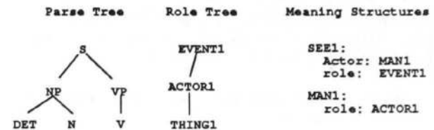
Figure 2: COMPERE's output for "The man saw."

The structures that exist after reading "The man saw" are shown in Figure 2.