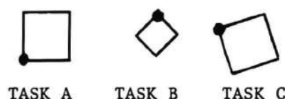
Figure 2. Tasks.