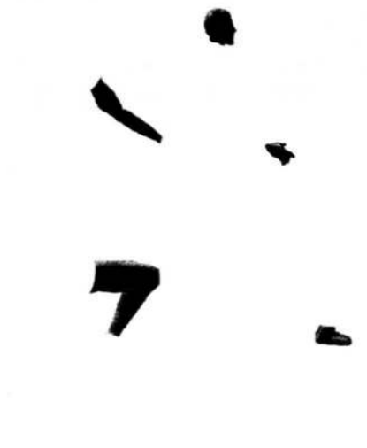
Figure 3: Disembodied Parts

Stimuli. The 12 poses used in Experiment 1 were modified to include the presentation of a single body part at a time (See Figure 3). Each of the 12 poses was divided into its component parts (head, hand, arm, foot, and leg) preserving the location and position of each individual part. Chest and back were eliminated due to the difficulties of recognizing them in isolation.