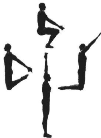
Figure 1: Four Testing Poses

counterbalanced across poses. The poses were created to maximize the amount and types of body part comparisons as well as to maximize the possible distance between various body parts. Each body was shown in three orientations: 0°, 90°, and 180°. Seven body parts were highlighted on each body using a uniform sized white dot placed approximately in the center of the body part. The seven highlighted parts were the head, arm, hand, chest, back, leg, and foot.