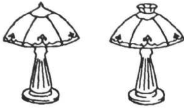
Figure 1. An example of an object in its original (left) and altered (right) form.

half of the trials the altered version of the target object was shown. The task was to decide whether the comparison item was identical to the target. For half of the trials of each type the context word was appropriate for the target object and for half of the trials it was inappropriate. In order to bring performance on this discrimination task above chance, it was necessary to raise the exposure duration. Two different durations were used, 180 ms and 230 ms, with half of the subjects tested at each duration.