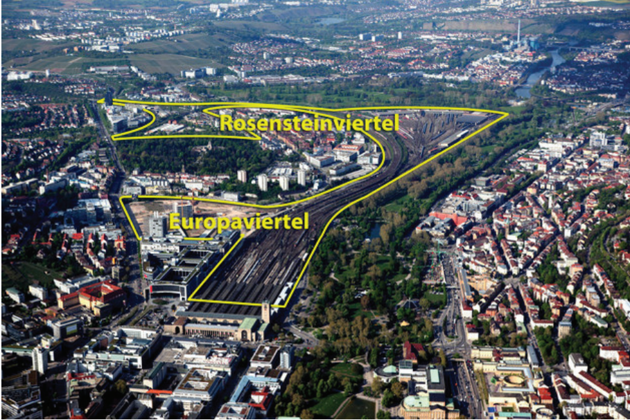
Figure 3. Aerial view of the redevelopment site.

The resulting open area would help resolve the issue of land scarcity without needing to expand into suburbia. Condensing the core at the expense of geographical expansion would meanwhile present a sustainable form of city growth. At the same time, the remaking of the urban core would improve the city's image by increasing its attractiveness. The division of the core would be resolved. The newly emerging quarters, with their valuable location in proximity to the central business district, central parks, and other recreation areas and their excellent future transportation connections, could possibly convince outward-oriented taxpayers to stay in town and buy a flat or an office in the center. The main station flagship project would create additional supraregional attention and improve the city image. Along the way, the realization of the project would boost the urban economy by creating several thousand new jobs during the construction period and resulting in supply effects for local and regional firms (Reuter 2001).