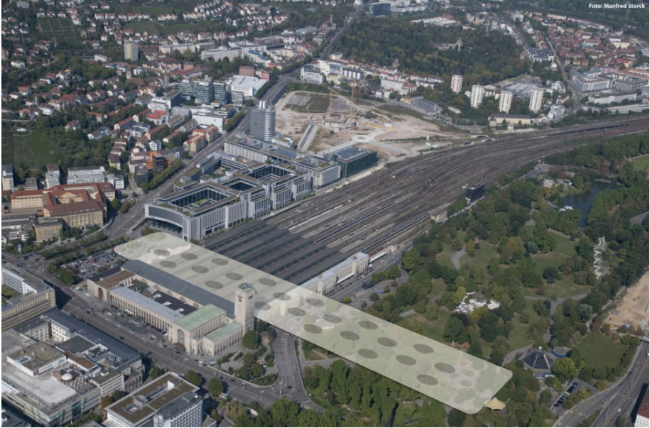
Figure 1. Location of the new central station, turned by 90°.