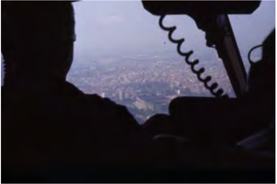
Figure 2. Edward Soja in a helicopter over Barcelona's metropolitan area (2001).

more so in Chicago, the postmodern focus of urban studies at the end of the 1980s was undoubtedly Los Angeles. The urban scenes in Blade Runner (1982) impressed us to such an extent that we saw there the dystopian future in Los Angeles, and through that vision of Los Angeles, we saw the future of our own European cities.