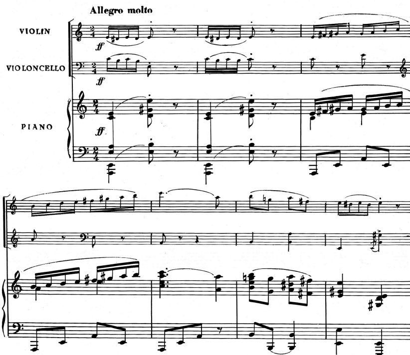
Example 2: Granados Piano Trio, fourth movement opening (autograph, Boileau, UME).