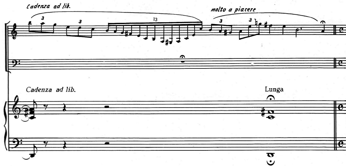
Example 1: Granados Piano Trio, first movement violin cadenza, m. 61 (autograph, Boileau, UME).