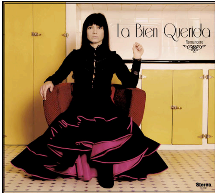
Example 15: Cover of the album Romancero by La bien querida.

All these changes experienced by indie music in Spain and the adaptations made from flamenco are easily observable and measurable: