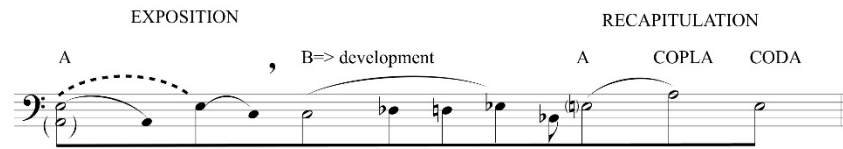
Example 16: Jerez, tonal/formal scheme.

The other piece with a predominant Phrygian mode, El Albaicín , although with a different formal design, makes use of the same functional ambiguity of the Phrygian mode and structurally plays with its dominant potentiality. Although initially in B \flat Minor, the music quickly falls into F Phrygian, the key of the main theme. In the final recapitulation, the main theme returns in F Phrygian, which acts as a dominant for the second theme in B \flat . El Albaicín is also the piece with stronger folk/flamenco flavor of the entire collection. Echoes of the bulerías and malagueñas resonate throughout the introduction and the main theme, which are contrasted with the cante jondo -like second theme. Albéniz also recreates some of the techniques of the guitar and the deep lamentations of the cante-jondo (deep song) singer. After all, this was the piece that Albéniz was referring to in the letter quoted at the beginning of this paper; this was one of the pieces with which Albéniz “carried the españolismo to the ultimate extreme.”