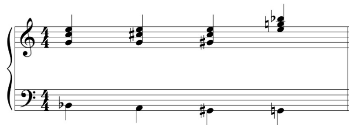
Example 7: Omnibus progression in Merlin . Mer/32/3.

root and \frac{6}{5} positions; just as Albéniz does with his augmented chord in example 5, which exactly corresponds with stages 2 and 4 of the “classical omnibus.” Finally, Yellin also noticed that the fourth chord of the progression could start a new “omnibus” by moving the chromatic descending line to a different voice, and that this process could be repeated ad infinitum . Therefore, one could easily harmonize an entire chromatic scale, resulting in what Robert Wason called an “extended omnibus”. 23 In general, omnibus progressions are very common in the romantic repertoire, since they can both easily serve to prolong a single chord, or be used to modulate to the most remote tonalities thanks to the enharmonic re-spelling of the dominant-seventh and augmented chords. These two possibilities coincide with Schenkerian and Schoenbergian interpretations of the progression. According to Yellin, the former viewed it as a prolongation of a dominant seventh chord and the latter as “functionless, not expressing an unmistakable tonality or requiring definite continuation.” 24 Although at first sight, the “omnibus” is not a progression that one tends to associate with Albéniz’s musical language, its use in Albéniz’s works can be dated back (at least) to Merlin , an ambitious opera composed between 1898 and 1902, and which is often unfairly disdained for its strong Wagnerian flavor. The following example is taken from the first act of Merlin .