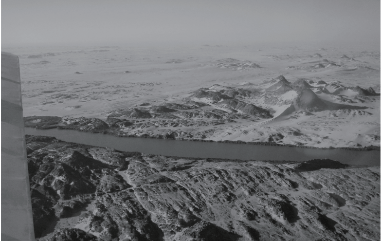
Fig. 1. Stretch of Batn el-Hajar showing mountains and the narrow river-bed.

the second feature of the refuge area warrior adaptation: relatively high population density in areas with low carrying capacity.