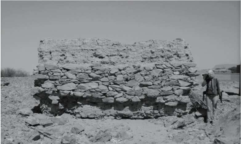
Fig. 2a-c. Probable tower- houses on Sai Island recorded by the Medieval Sai Project in 2009. a: Site 8-G-510; b: Site 8-G-503; c: Site 8-G-509.