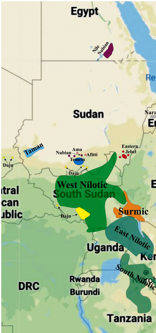
Map 1. The East Sudanic languages

The nine branches remain the accepted listing with some relatively minor reassignments. There have been few attempts to synthesise data on East Sudanic, the unpublished MSc thesis of Ross, 11 who was a student of Bender, and Bender's own studies and monograph. 12 The study by Starostin of Nubian–Nara–Tama is part of a project to re-evaluate East Sudanic as a whole from the point of view of