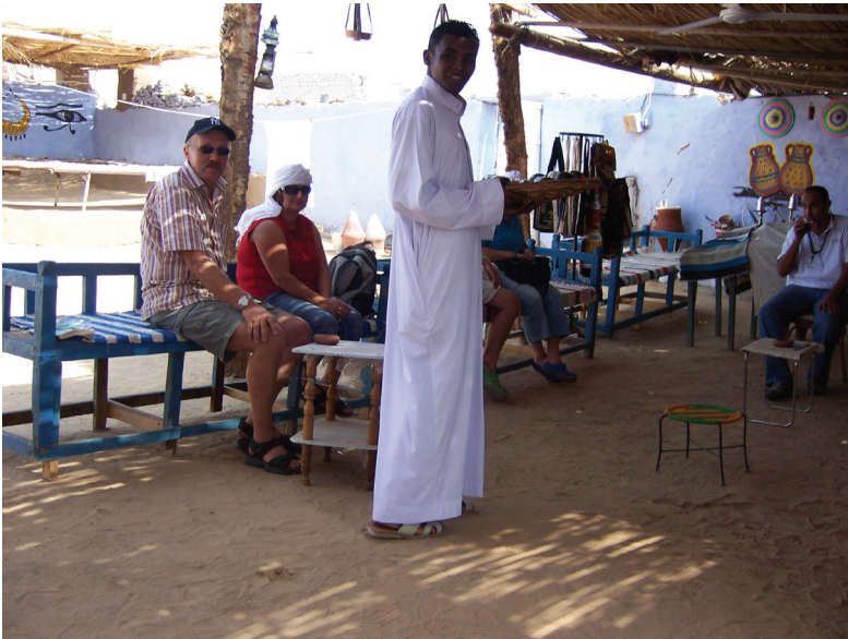
Figure 8. A tourist group being welcomed into the courtyard of a Nubian house. (Jennings, 2007).