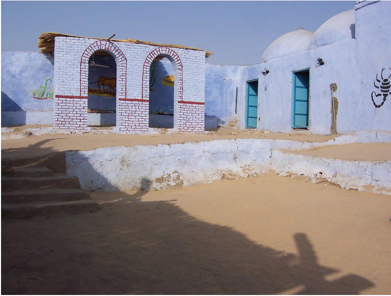
Figure 7. The wide courtyard of a traditional Nubian home, where celebrations and ceremonies are held. (Jennings, 2007).