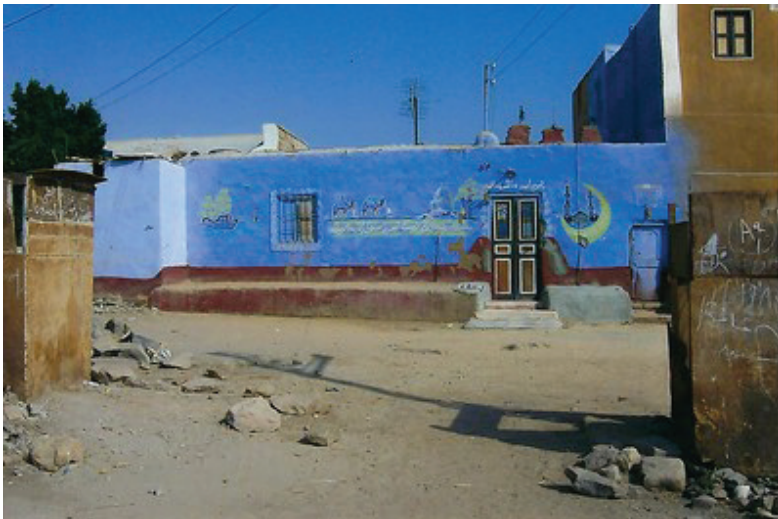
Figure 4. Some houses have paintings on their walls, indicating that the owner has made the pilgrimage to Mecca (Jennings, 1981).