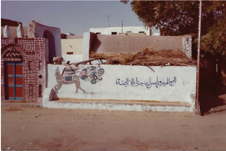
Figure 3. Many walls display a representation of Al Buraq, the mythical being who, according to legend, carried Mohammed to heaven on her back. (Jennings, 1981).