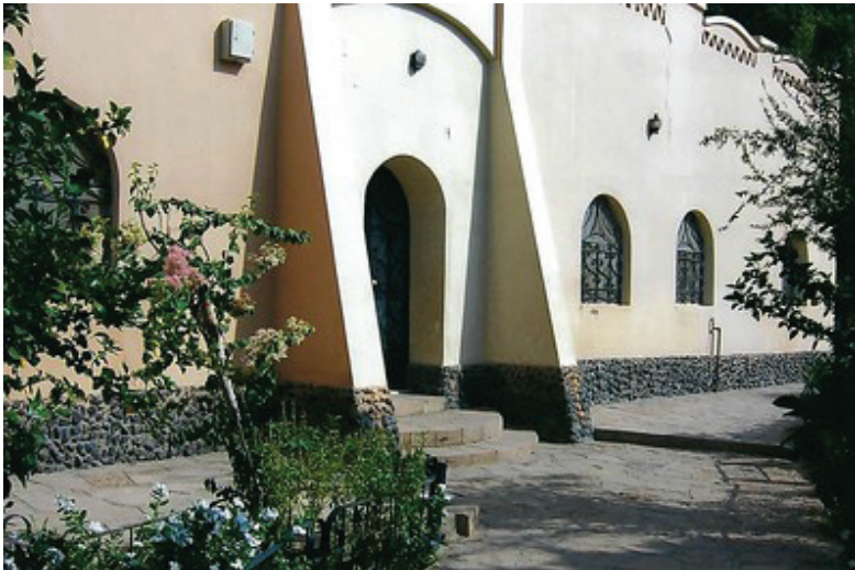
Figure 12. This home is offered as a Bed & Breakfast for any tourist who wants to spend more time in Nubia. (Jennings, 2007).