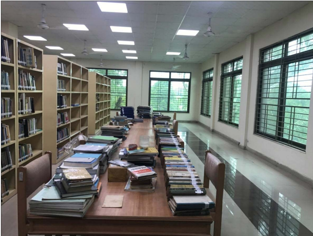
Photo 1. View of natural light coming through from the large windows.

The respondents identified cloth and paper bags usage as a forgotten practice in Pakistan. One respondent noted: