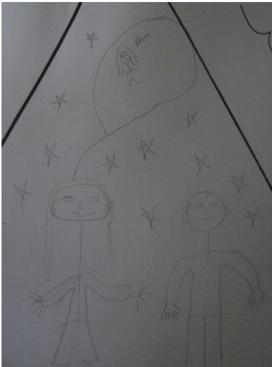
Figure 2. Ceci's Graffiti Board Sketch. Adapted from Short et al., 1996, Creating Classrooms for Authors and Inquirers .