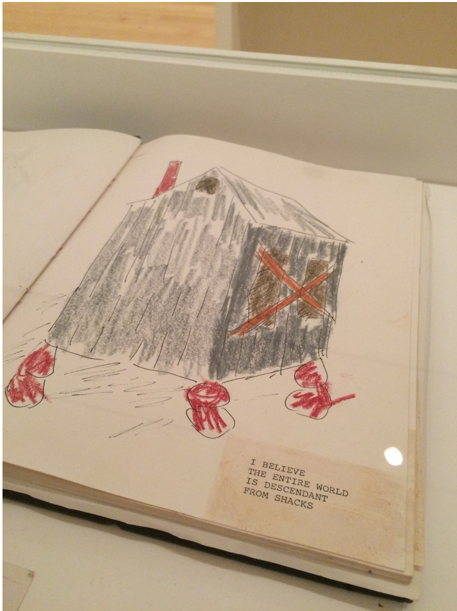
Figure 1. Beverly Buchanan notebook image. From " Beverly Buchanan - Ruins and Rituals. " By Czacki, 10/21/2016-03/05/2017.

structure. What is reclaimed in the ashes of something that should never have existed, that existed at the expense of the multiple for the benefit of the singular.