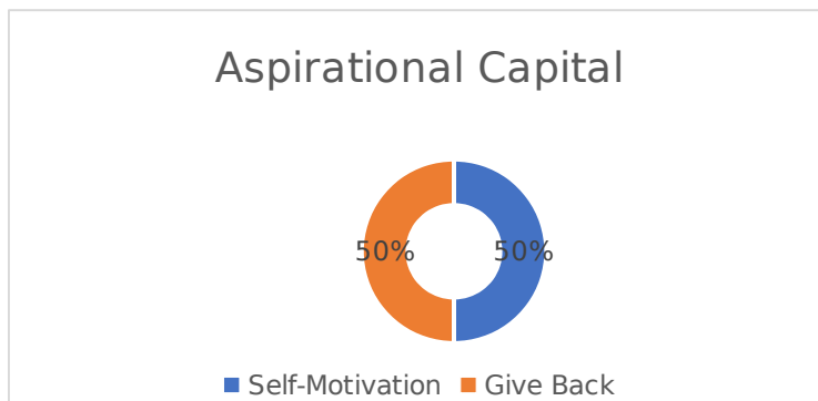
Figure 1. Aspirational Capital.

Aspirational capital. Responses from the four interviews suggests that there were two main components that influenced aspirational capital: self-motivation and the opportunity to give back.