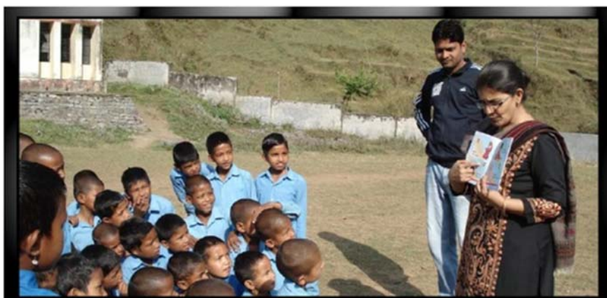
Figure 3. Distribution of RAJI alphabet reader at Raji Awaasiya Vidyalaya, Jauljibi

This work describes the process and methodology of Orthography development of Raji, a previously undocumented language, spoken by a small number of speakers in the district of Pithoragarh. This work was done in collaboration with the community. My role was to make them aware regarding the importance of documentation and preservation of their mother tongue. I provided them guidance with linguistic issues and spelling options. Some of the decisions taken during this early stage may need revision in future. As mentioned earlier in the next phase I prepared an Alphabet reader “Raji varna mala” for the community.