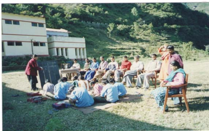
Figure 2. Model Essay Contest , Raji Residential School, Jauljibi

Introducing native literacy for an oral language can have many positive and negative implications. Some negatives are highlighted by Hinton (2001) such as - native speaker's loss of control over the language; freezing of the language and disagreement within the community. Positives of writing the oral language include- written language documentation for language survival; expansion of language use to other domains; empowerment of the community. During the early years of my work I had realized that Rajis have very negative attitude towards their mother tongue. They seem to be acutely aware of the fact that their mother tongue has very little scope in promoting upward mobility and it will not provide them food, education etc. The attitude of the dominant group was also not very encouraging. So in Raji's context the question whether to write down their language or not was never important because their language was neither important for them nor they had any sense of pride for their mother tongue. Gradually I started working in this direction and after working with them for around nine years I succeeded in instilling the importance of their mother tongue and the need for its preservation. As a result many youngsters and some middle aged Raji came forward and helped me in the present orthography development programme.